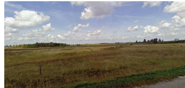
Figure 2.1-1: Glenarm Project Area as seen from Glenarm Road

The project is located in the Lake Simcoe-Rideau Ecoregion (6E) per MNR's Ecological Land Classification Primer (March 2007). An ecoregion is defined by a characteristic range and pattern in climatic variables including temperature, precipitation and humidity. The climate within an ecoregion has a profound influence on the vegetation types, soil formation, other ecosystem processes and biota associated with the ecoregion. Currently, 57% of the ecoregion exists as agricultural land, with deciduous and mixed forests covering a majority of the remaining natural landscape.